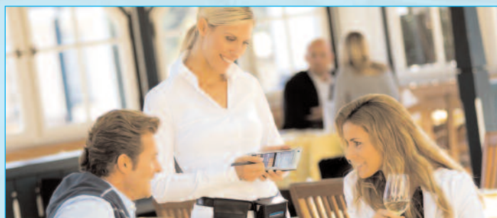
CBE software systems and solutions. Visit stand no. D10

When it comes to products Hospitality Expo covers an incredible variety with everything from popcorn and slushies from Fun Foods through the full range of food and drink from Simply Foods , frozen fruit and vegetable purees from Les Vergers Boiron to handmade preserves from G's Gourmet Jams on show.