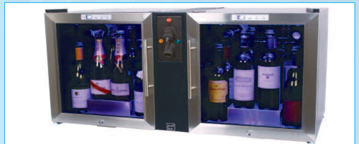
Febvre will be showing their Le Verre De Vin Pod Bars which feature 2 digitally controlled temperature chambers. Sample their Fleur Du Cap wine in the RAI Restaurant.

Despite the increasing dominance of credit cards the hospitality sector remains very much a cash business. This means that security and efficiency in cash handling and management are of paramount importance. If you're looking for new or improved solutions for your business you'll find them at Hospitality Expo with leading companies in the field including G4S Cash Solutions ; APT Safe-link ; Money Point Ltd all in attendance.