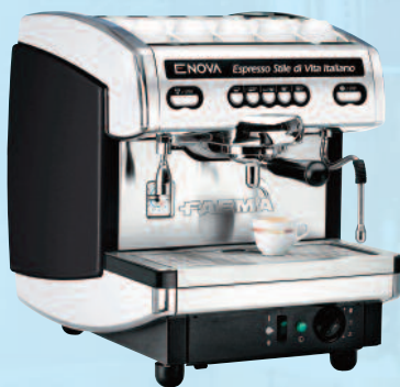
Milano Coffee Systems Enova which is suitable for any small bar. Visit stand no. B22

Far more traditional is the old reliable in-room Corby Trouser Press and Corby of Windsor will be at Hospitality Expo showing not just the trouser press but also their range of irons, ironing centres, kettles, hairdryers, mini-bars safes, and many more guest room amenity products.