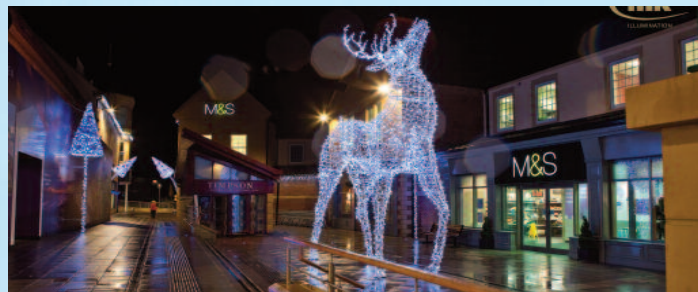
MK Illumination - stand no.B50