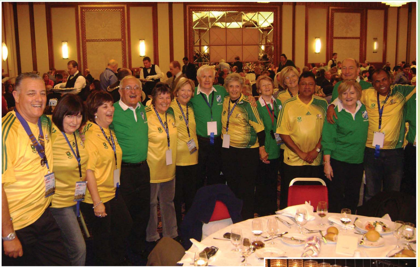
Irish and South African Skålleagues take time out to discuss rugby in Budapest.