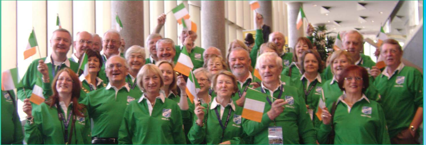
The Green Army at the Skål World Congress in Budapest

T welve members of Skål International Dublin were part of a 'Green Army' of Irish Skålleagues who made a major impact at the World Congress in Budapest during the first week of November.